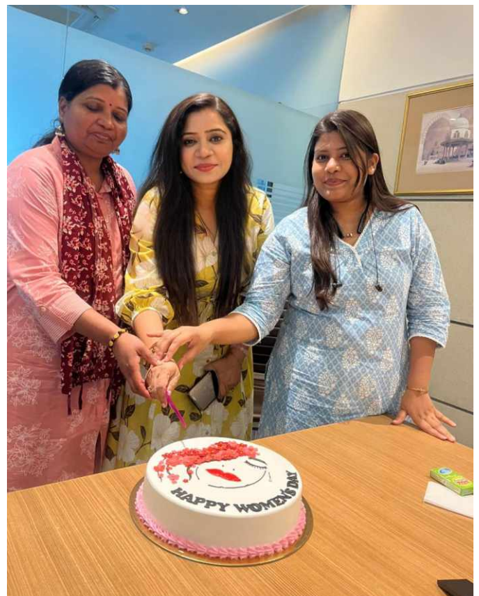
Celebrating Strength, Resilience & Leadership – International Women’s Day at Sara House 6th March 2026

A matter of pride for Sara Group is that many of our key and critical departments are led by women, reflecting the organization’s strong belief in diversity, capability, and inclusive leadership. Their vision, resilience, and leadership continue to play a significant role in driving business success and shaping the company’s future.