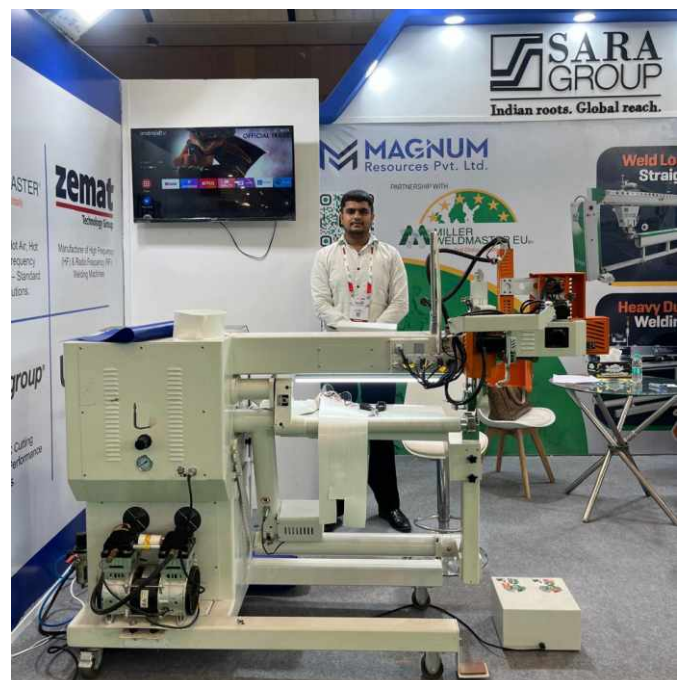
IHT&TT Texwork Exhibition-13 March 2026-New Delhi