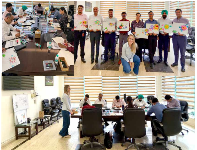
One team, one direction — the HTG Annual Offsite 2026 brought clarity, connection, and renewed purpose.

The session provided the team with a valuable opportunity to revisit key objectives, assess progress, and realign priorities for the remainder of the year. Blending strategic reflection with personal development, the offsite encouraged open and constructive dialogue around achievements, challenges, and the road ahead.