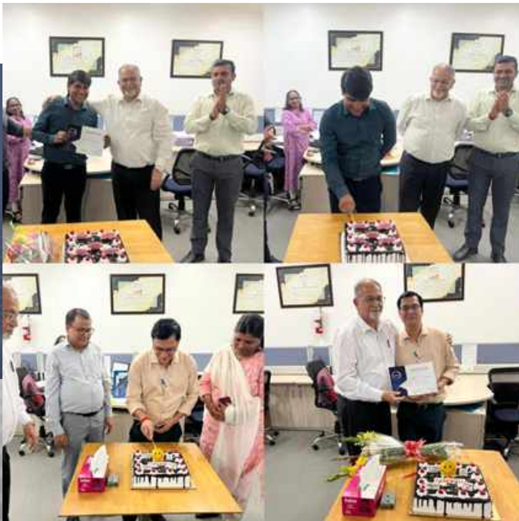
Honouring Years of Dedication – A Heartfelt Farewell

We extend our sincere thanks for their years of dedication and wish them continued success, happiness, and fulfillment in the journey ahead.