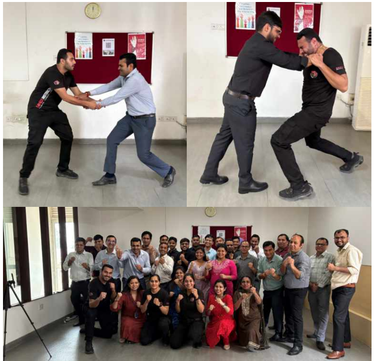
Aware. Prepared. Empowered. — The KAVACH Way

The session focused on building confidence, mental preparedness, and awareness rather than physical strength. Led by highly experienced trainers with backgrounds in defense and law enforcement, the workshop introduced simple yet effective techniques that can be applied in real-life situations. What made this initiative truly impactful was its inclusive approach—open to all employees regardless of age, fitness level, or prior experience. It served as a reminder that personal safety begins with awareness and the right mindset.