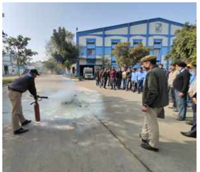
Train hard. Stay safe- Fire Mock Drill at Nalagarh Plant

response capabilities. Our fire-fighting team received hands-on training in handling emergency situations, operating fire safety equipment effectively, and responding swiftly during fire incidents.