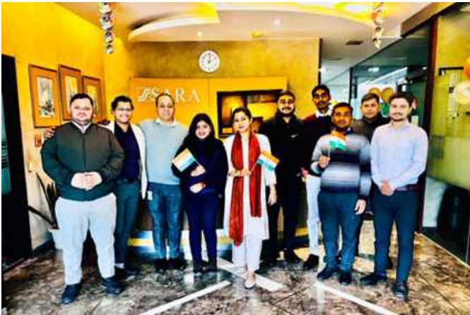
Celebrating Unity in Diversity – Republic Day at Sara House 23rd January

Sara Group proudly celebrated Republic Day at Sara House with great patriotism and enthusiasm. The occasion brought together team members to honor the values of our Constitution and reflect on the spirit of unity, diversity, and national pride.