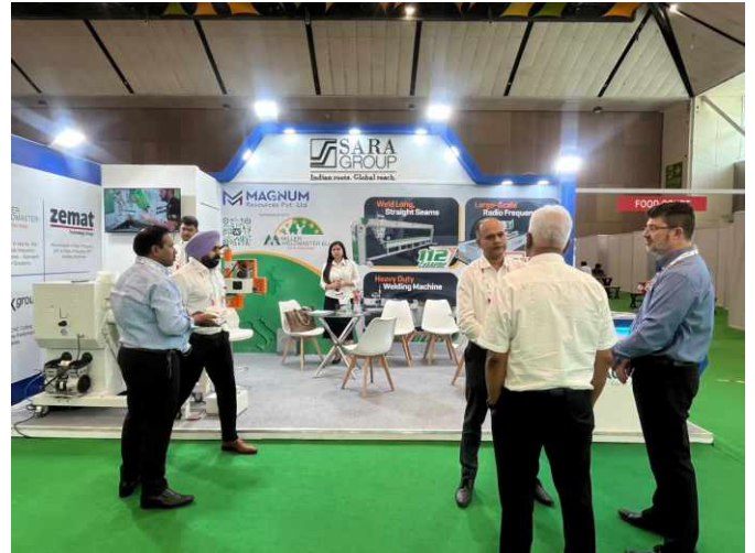
IHT&TT Texwork Exhibition-13 March 2026-New Delhi