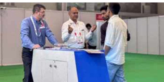
Interaction with Potential Customers at Texwork Exhibition-New Delhi

We are pleased to share that our HT & TT team participated in the Texwork 2026 exhibition, held in New Delhi from 13th to 14th March 2026. The show provided a valuable platform to engage with industry peers, explore the latest developments in technical textiles, and strengthen SARA's presence in the sector.