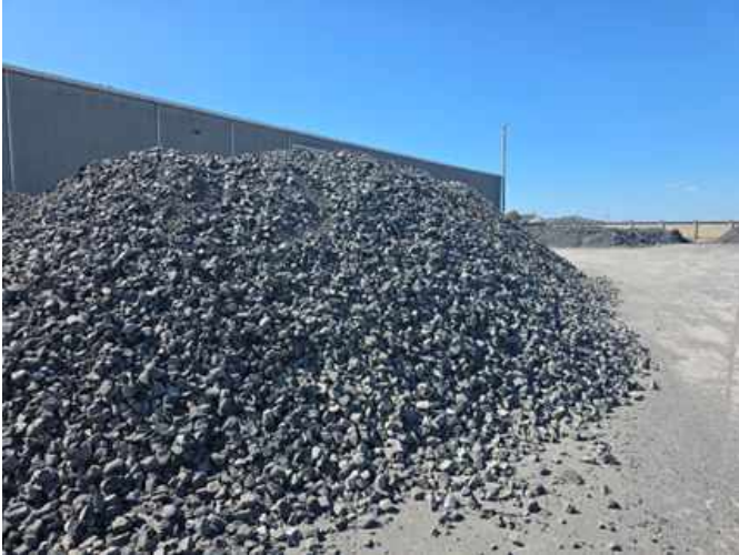
Chrome ore Stock at Durrës Port.