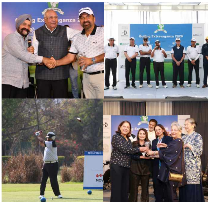
Swings, smiles, and strong connections — Golfing Extravaganza 2026 at Qutub Golf Course, 28th February 2026

Through initiatives like KAVACH, SARA Group continues to foster a culture where employees feel secure, confident, and empowered—both within and beyond the workplace.