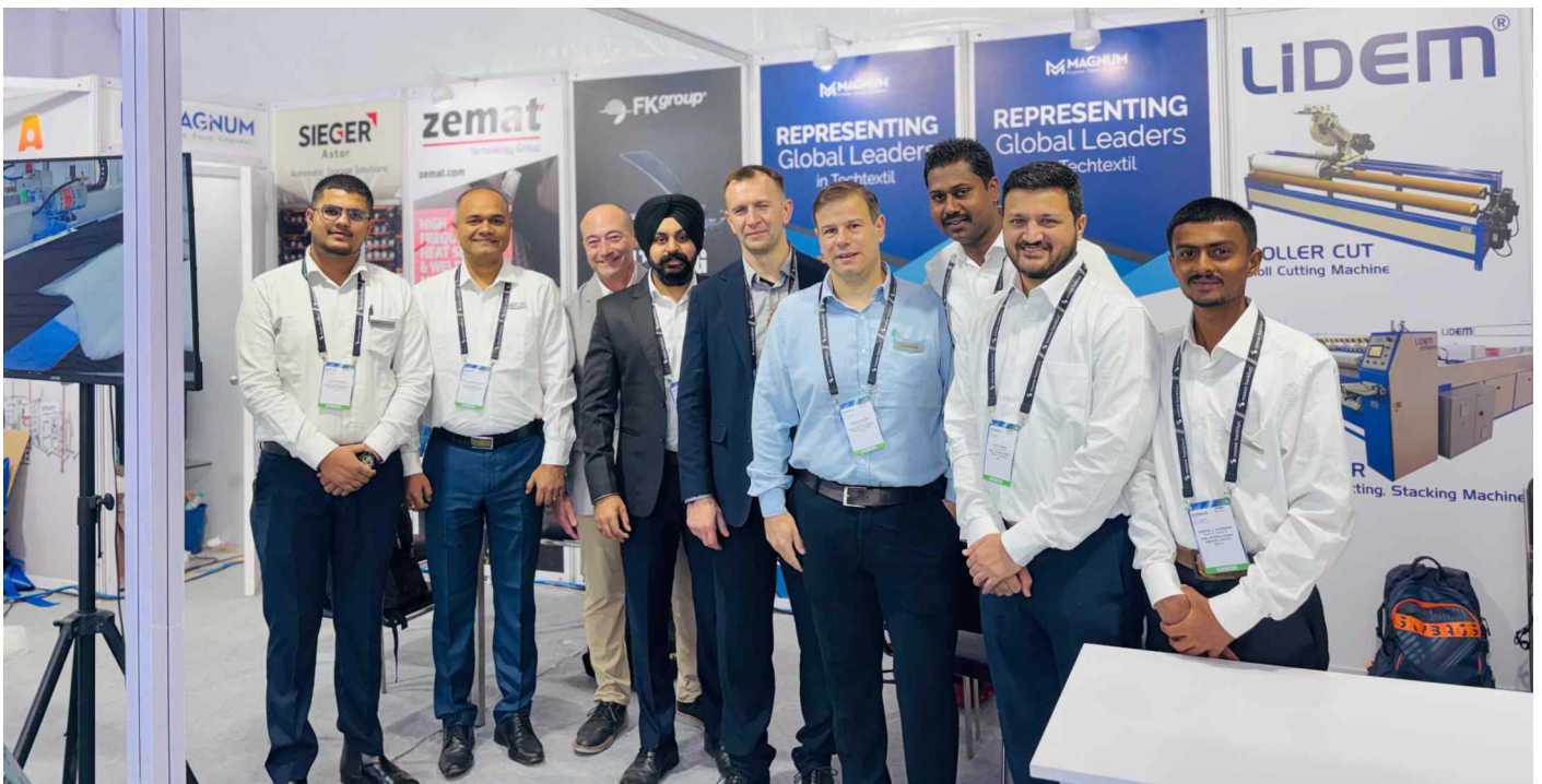
Mumbai Textile Exhibition 2025

In addition, we are proud to announce that the HT & TT Department participated for the first time in the renowned "Techtextil 2025" exhibition, held in Mumbai from 19th to 21st November 2025. The exhibition served as a significant platform to explore emerging innovations, engage with global technology leaders and gain insights into future trends in technical textiles. This milestone participation reflects our continuous efforts to remain aligned with industry advancements and reinforces our commitment to innovation, quality and excellence.