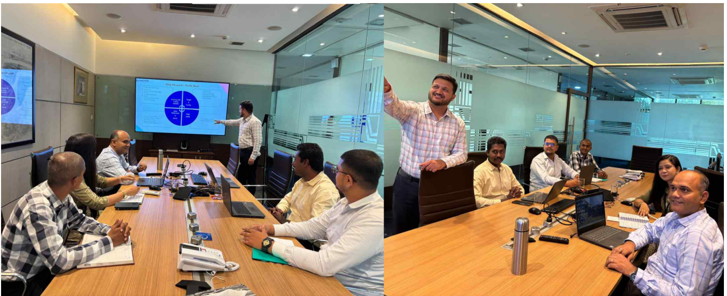
HT&TT- Goal Setting Meeting at Sara House

The offsite successfully blended strategic reflection with personal development, encouraging open dialogue on achievements, challenges and the road ahead. This continuity helped reinforce shared goals while strengthening collaboration and collective ownership among team members.