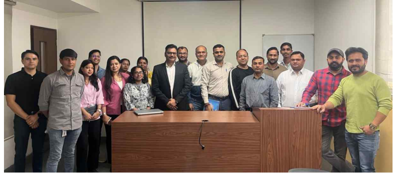
Sensitization session for our team members at SARA Group -15th November 2025