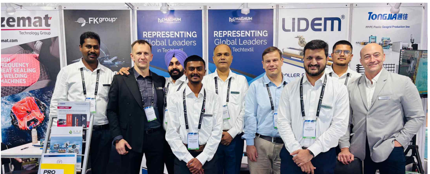
A proud moment with our team, showcasing our presence and engagement in one of the leading textile industry exhibitions.