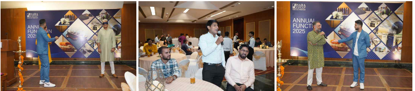
Enjoying Fun Activities

The event was packed with engaging and fun activities that brought out the laughter and excitement in everyone. Whether it was the spirited games or the light-hearted team challenges, employees across departments participated with immense enthusiasm, showcasing the unity and energy.