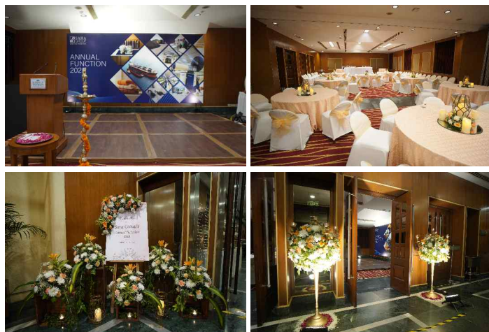
Sara Group Annual Function 17th October-2025