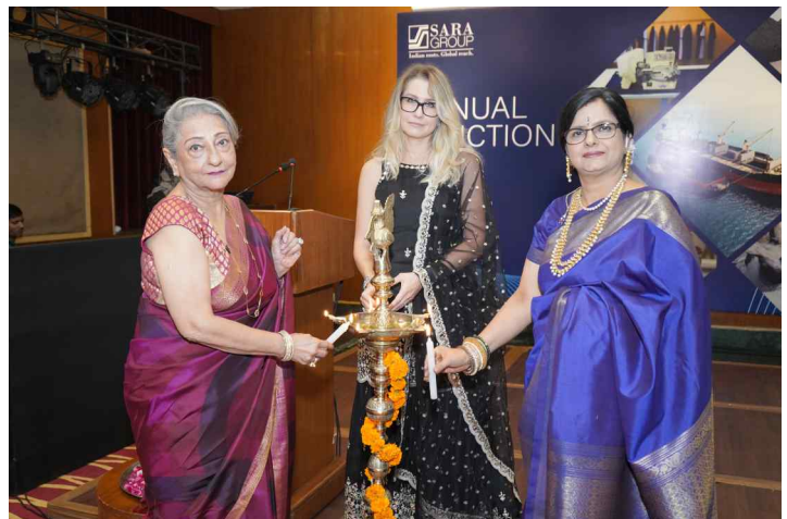
Lighting the lamp to ignite a new year of growth, success, and prosperity at the Sara Group Annual Function.