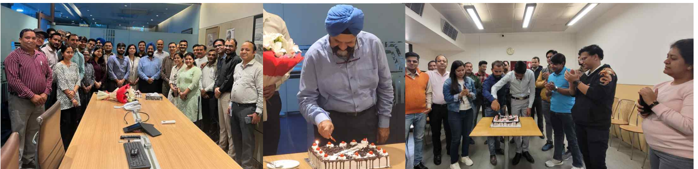
Monthly Birthday Celebration at Sara House

Monthly birthday celebrations in the office play a key role in fostering a positive and inclusive workplace culture. They offer an opportunity for colleagues to connect, celebrate each other, and strengthen team dynamics. Recognizing each employee's special day shows appreciation for their contributions to the team.