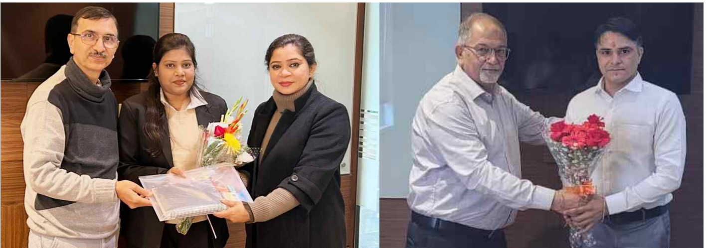
Welcoming New Joinees

Sara Group extend a heartfelt welcome to our newest members. Welcoming new employees is a critical process for any organization, as it sets the tone for the employee's relationship with the company. We believe that every new member is a valuable addition to our family. On the first day, introducing the new employee to the company culture, policies, and procedures including job responsibilities, benefits, and other important information.