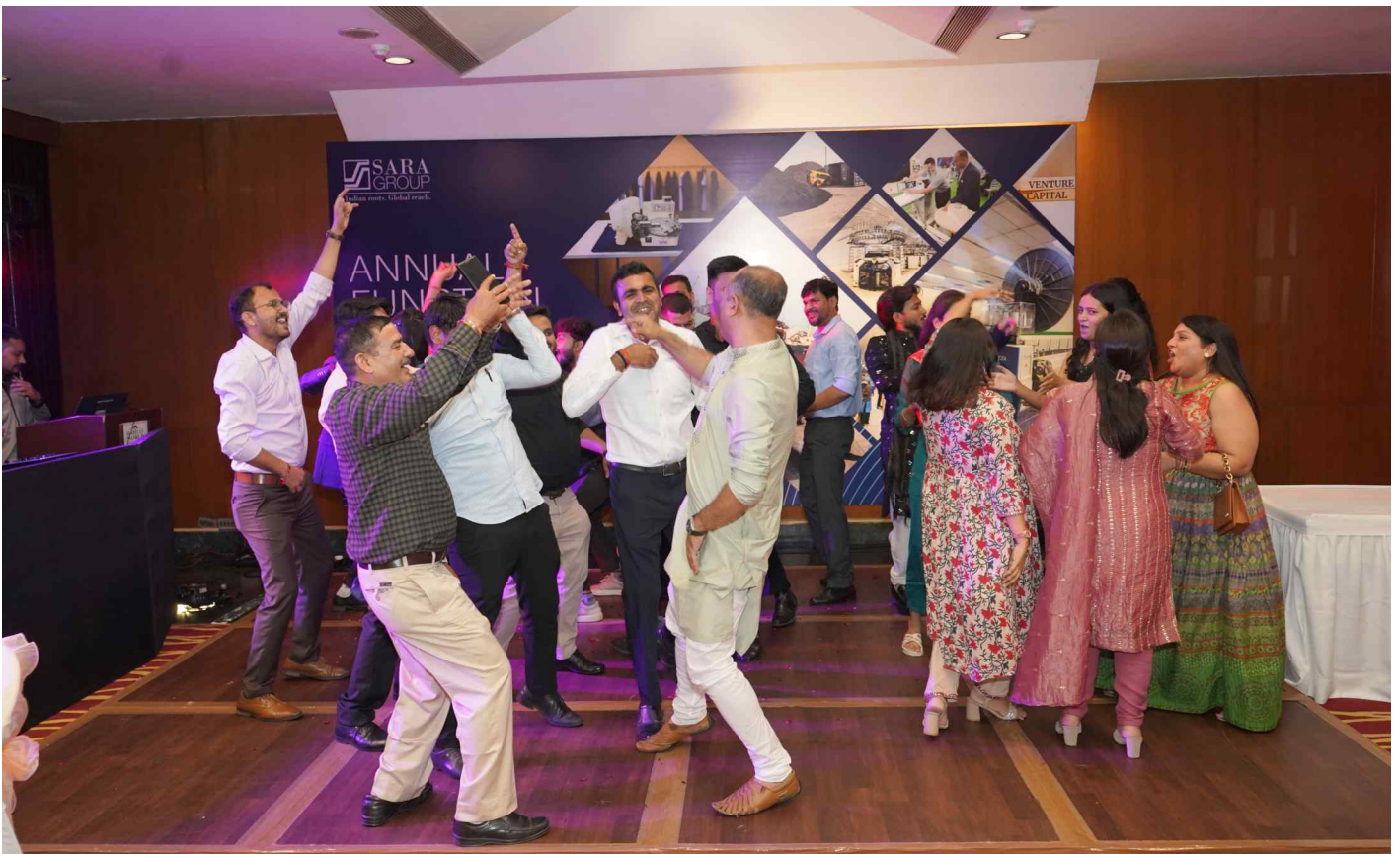
Celebrating the spirit of togetherness and joy on the dance floor at our Annual Day

As the formalities concluded, the stage was set for a spectacular dance performance that brought everyone to their feet. The rhythm and energy of the performances were contagious and soon the dance floor was filled with employees grooving together. It was a wonderful reminder of the joy that comes from being part of a close-knit team that knows how to celebrate together.