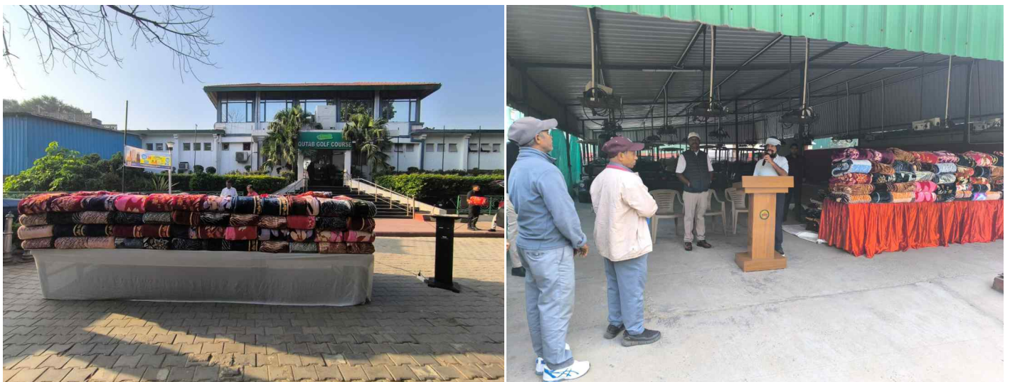
Blanket Distribution at Qutub Golf Course on 5th November 2025 & Delhi Golf Course on 6th November 2025

A heartwarming initiative undertaken by Sara Group that truly embodies the spirit of giving and community service. As part of our ongoing commitment to social responsibility, the group recently organized a "Blanket Distribution Drive". This initiative aimed to bring warmth and comfort to those in need during the colder months. We conducted two drives dated 5th November 2025 at Qutub Golf Course & 6th November 2025 at Delhi Golf Course.