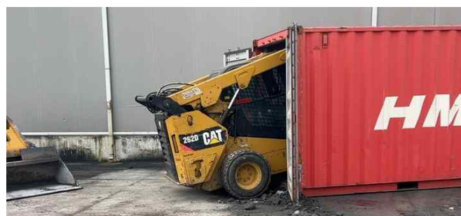
De-stuffing Albania Lumps at DP Qinzhou port & Cargo Stuffing at the load port in Albania