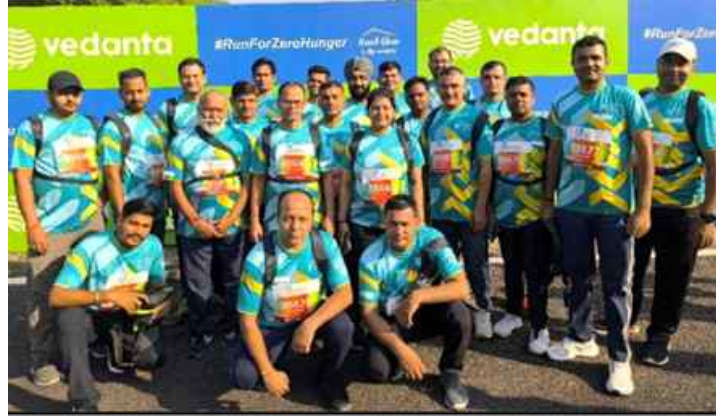
Sara Groups participation in the Vedanta Delhi Half Marathon October-12th, 2025

Sara Group participated in the Vedanta Delhi Half Marathon on October 12th, 2025. The Sara Group has once again showcased not only their commitment to excellence in the workplace but also their dedication to health and well-being outside of the office.