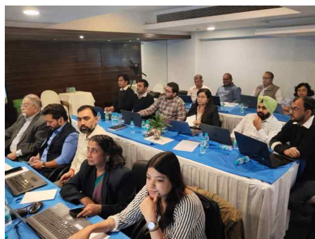
Building a digitally empowered workforce through the "AI-First Mindset" workshop at Sara Group.