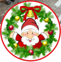
Christmas Celebration at Sara House -24th December 2025