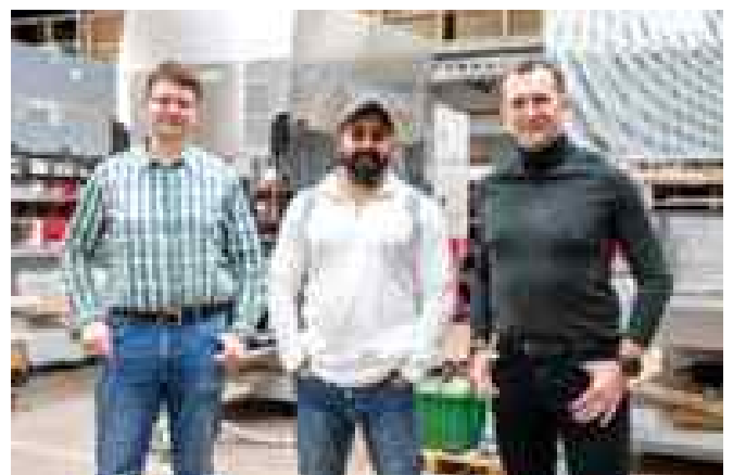
Technical interaction with experts during international training program