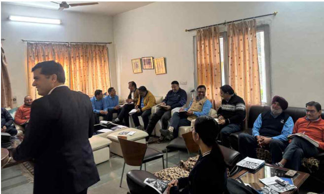
Leadership Development Session at Nalagarh

The session emphasized the value of having a clear roadmap to achieve organizational targets, the need for setting realistic and achievable goals and continuous monitoring of the progress towards the goals we set, and the critical role of effective delegation in driving performance. A key takeaway was that sustainable success is achieved through collective effort and empowered teams, rather than individual contribution alone.