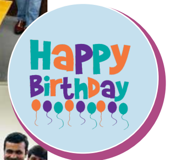
Cheers to another month of smiles, laughter, and togetherness!