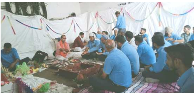
Vishwakarma Pooja Celebration at Nalagarh on 17th September 2025

Sara Textiles proudly celebrated Vishwakarma Divas at our factory, honoring Lord Vishwakarma, the divine architect and craftsman.