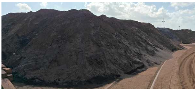
Chrome Concentrate at Beira Port, Mozambique

In the last week of September, Tsingshan Group announced its October HC ferrochrome tender price at 8,495 yuan/ton, marking a month-on-month increase of 200 yuan/ton. This confirmed market expectations of a potential price rise. While the tender price still remains below retail levels, further upward movement will depend on subsequent demand trends and cost fluctuations. With the announcement of the guidance price and the onset of China’s National Holidays, the market has adopted a wait-and-watch stance.