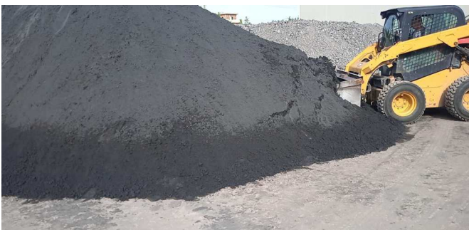
Albania Chrome ore Concentrate -Stuffing Port Square

After a brief pause, exports from Albania have resumed. We exported 12,450 MT in Q2, and with the easing of ocean freight rates, we anticipate exporting around 15,000 MT in the next quarter.