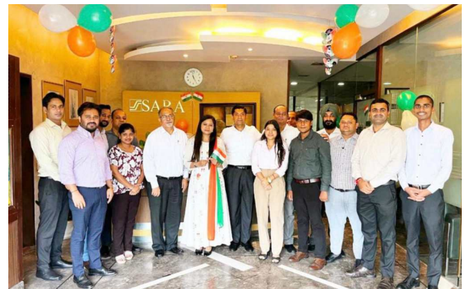
Independence Day Celebration at Sara House on 14th August

The celebrations were filled with joy, pride, and a sense of unity. It was a memorable day, reinforcing our commitment to our nation's values and progress.