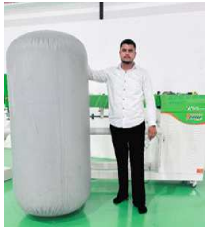
Successful Installation of T600 Machine at TS Continental Impex, Kuala Lumpur, Malaysia

Our skilled service team not only completed the installation seamlessly but also fabricated the final prototype product in-house — a proud demonstration of MRPL's technical expertise, precision, and commitment to customer satisfaction.