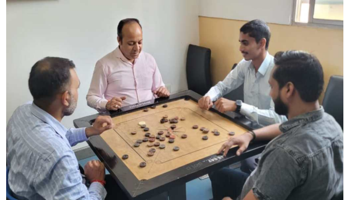
Promoting Well-Being: A Break That Builds Bonds

Recently, our team took a well-deserved break from their busy schedules to engage in a fun carrom session. Simple activities like these not only help in relieving stress but also strengthen bonds among team members, fostering a positive and supportive work environment.