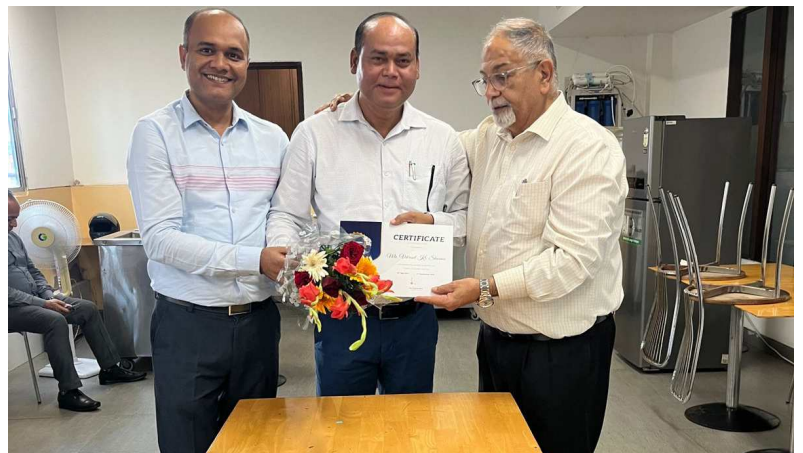
Honouring Dedication and Excellence- Presenting a Certificate of Appreciation