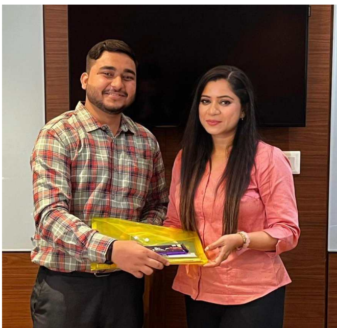
Welcoming New Joinees