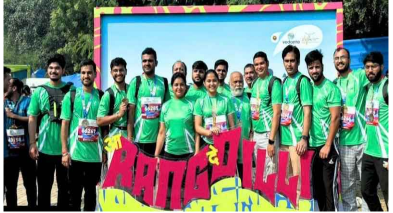
Sara Groups participation in the Vedanta Delhi Half Marathon October-20, 2024

Sara Group participated in the Vedanta Delhi Half Marathon on October 20th, 2024. The Sara Group has once again showcased not only their commitment to excellence in the workplace but also their dedication to health and well-being outside of the office.