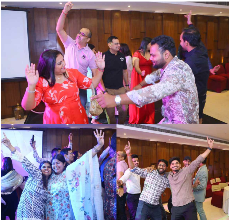
Celebrating the spirit of togetherness and joy on the dance floor at our Annual Day