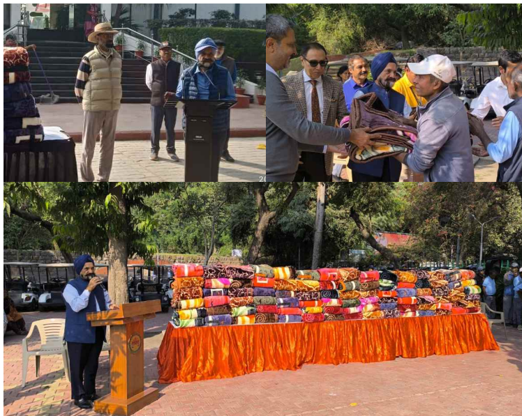
Blanket Distribution at Delhi Golf Course 28th November 2024 & Qutub Golf Course 30th November 2024