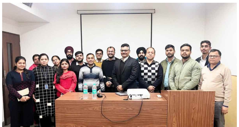
Sensitization session for our team members at SARA Group -27th December 2024