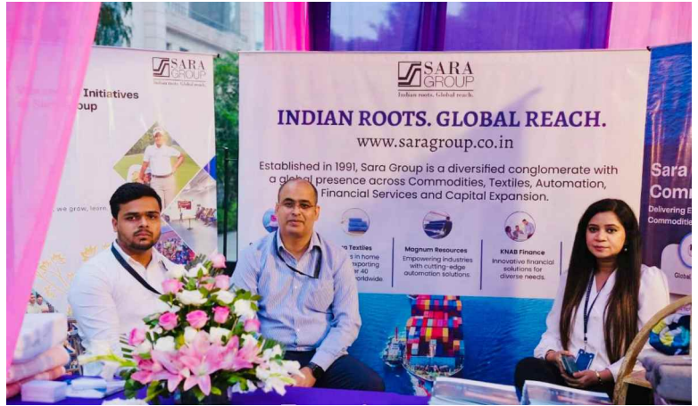
A dedicated booth to showcase our range of services, products, and innovative solutions at IIFT-Delhi-16 November 2024

We are thrilled to have been the Title Sponsor for the prestigious IIFT Alumni Meet GAR-2024! Our team had an incredible experience connecting with alumni, industry leaders, and future innovators at this dynamic event. As part of our sponsorship, we proudly showcased our diverse business offerings through a dedicated booth, where attendees explored our range of services, products, and innovative solutions.