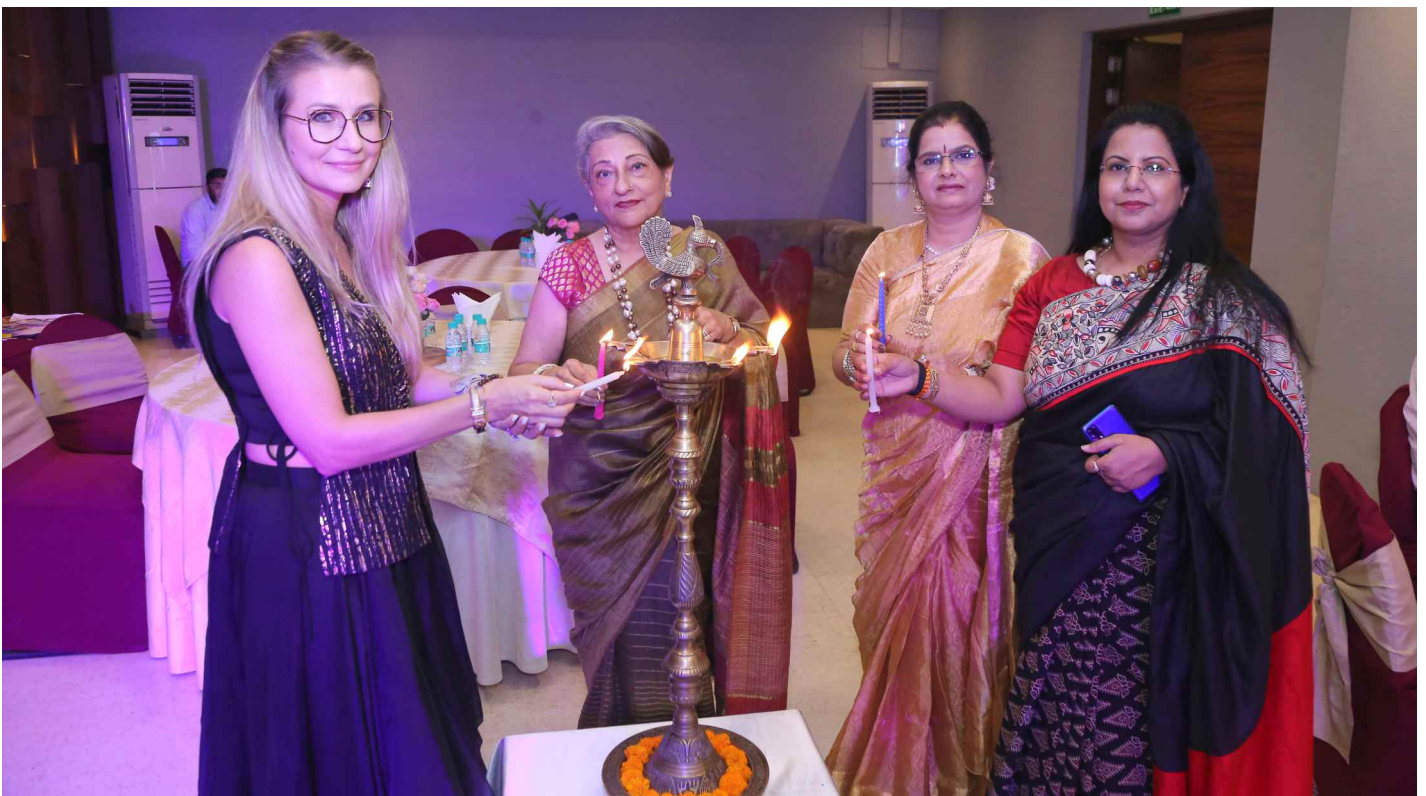
Lighting the lamp to ignite a new year of growth, success, and prosperity at the Sara Group Annual Function.

The much-awaited Sara Group Annual Function 2024 was an evening to remember, filled with joy, camaraderie, and a celebration of the incredible journey we have undertaken together as one united family. Held with grandeur and enthusiasm, the event perfectly encapsulated the spirit of Sara Group.