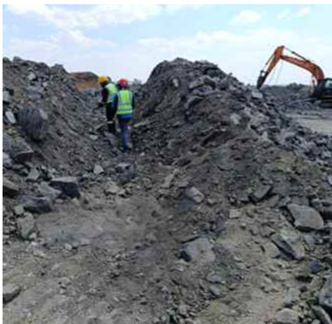
Stock sampling at mine

Since late September, the price of chrome ore has been in free fall, with a cumulative decrease of $80/ton in the future prices for South African chrome ore concentrates (40-42%), and a cumulative drop of $16 CNY/dmtu in spot prices. There are no signs of a halt to the decline, and further drops are expected in the coming weeks. Chrome-related participants, including chrome ore traders and alloy factories, continue to have a strong bearish sentiment towards the future market.