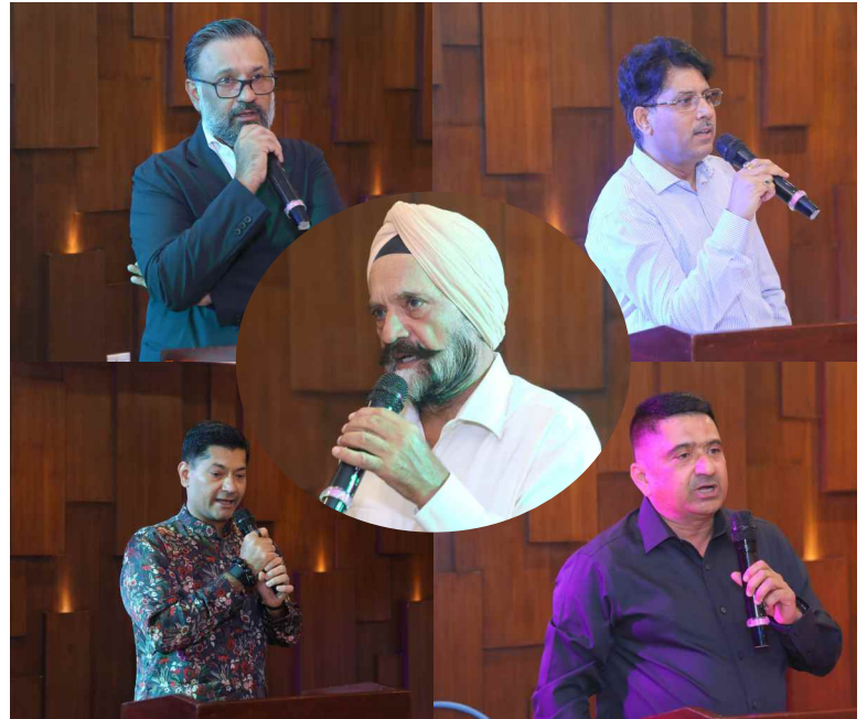
Valuable insights and inspiring words from our directors, guiding us towards a brighter future.

Their words were not just a celebration of our successes but also a vision for the future.