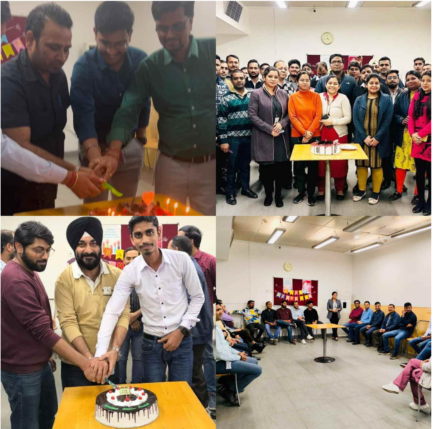
Monthly Birthday Celebration at Sara House

Monthly birthday celebrations in the office play a key role in fostering a positive and inclusive workplace culture. They offer an opportunity for colleagues to connect, celebrate each other, and strengthen team dynamics. Recognizing each employee's special day shows appreciation for their contributions to the team.