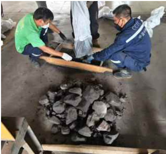
Sampling of CCIC Lab Qinzhou Port

Glencore followed with lowering 42/40 South African concentrates price by $20 to $250, but with limited transactions. However, Tsingshan did not follow the same reduction as TISCO and chose to lower the tender price by CNY 700/mt, which caused a stir in the market.