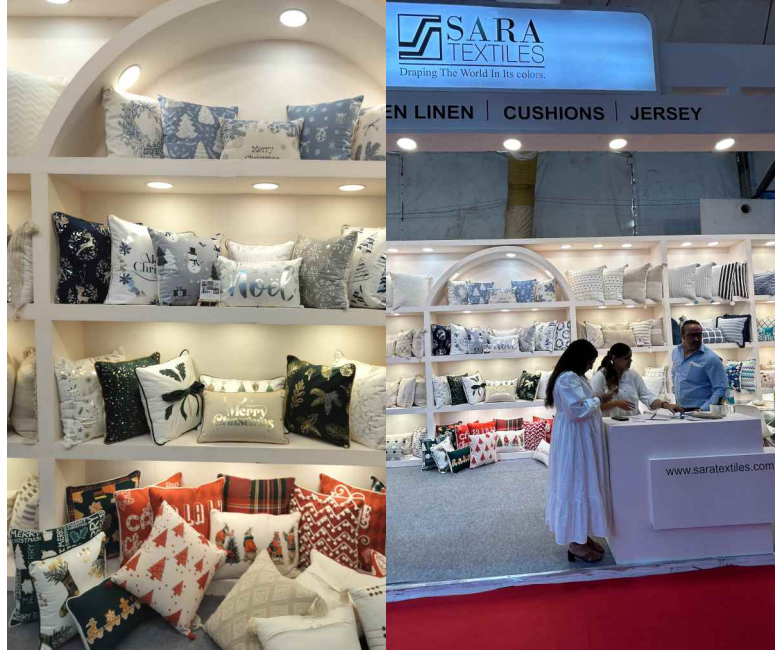
IHGF Delhi Fair October 2024

The company is also excited to announce a major milestone in its growth—SARA Textiles Ltd. has doubled its production capacity from 400 MT to 700 MT!