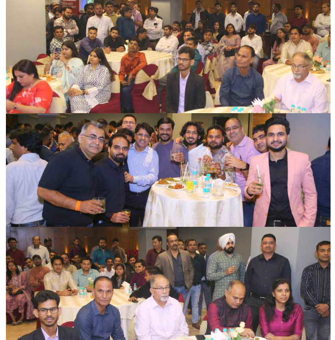
A Toast to Togetherness

As the evening drew to a close, the smiles and laughter lingering in the air were a clear sign of a successful celebration.