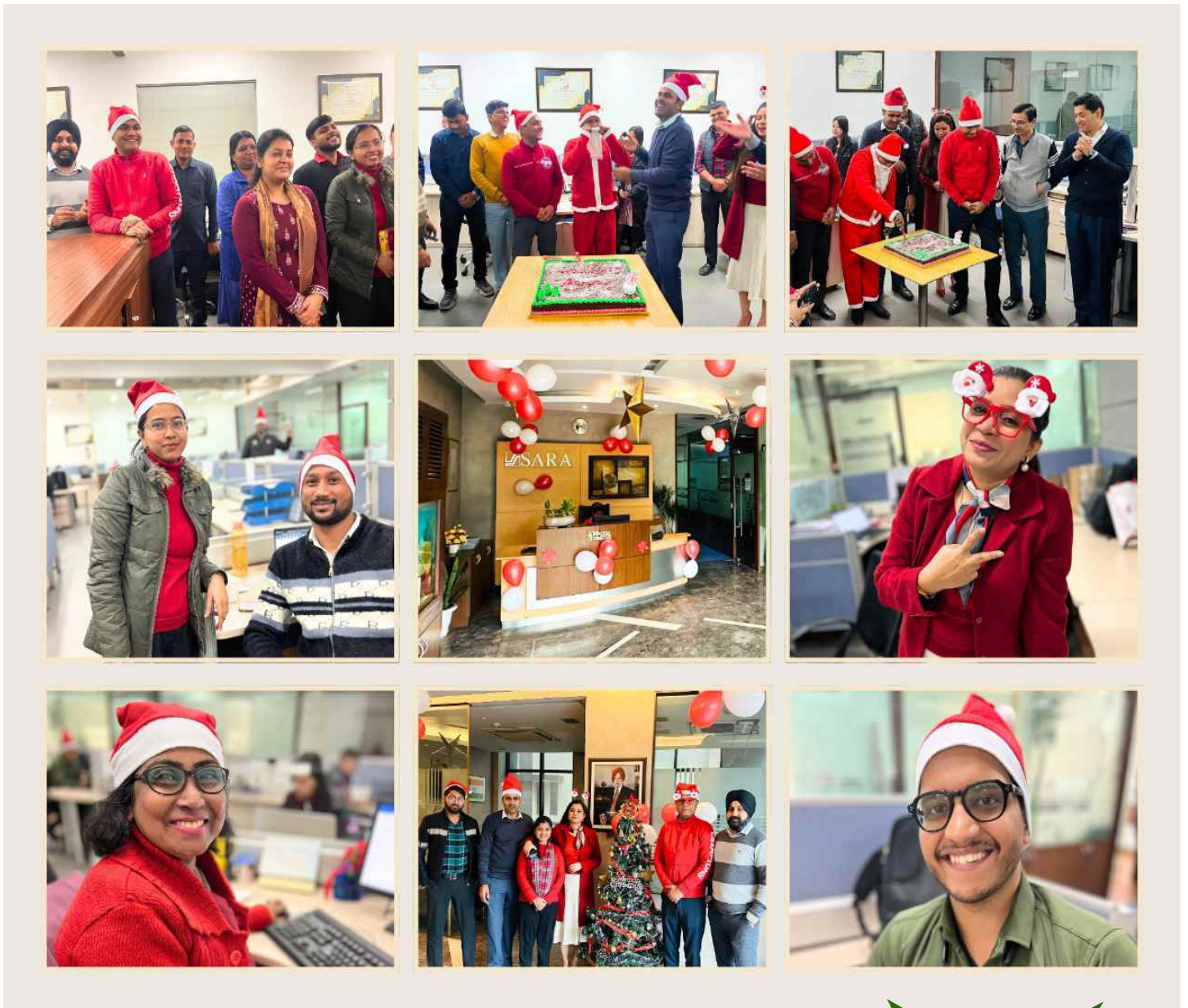
Christmas Celebration at Sara House -24th December 2024

The festive season brought joy and excitement to Sara House as employees came together to celebrate Christmas in style. The office was adorned with dazzling lights, a magnificent Christmas tree, and festive decorations that instantly lifted everyone's spirits.