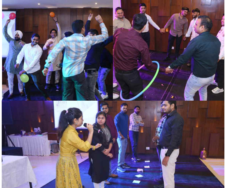
Enjoying Fun Activities