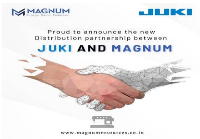
Announcement- partnership between JUKI and Magnum Resources-5th Oct-2023

The last quarter marked a significant milestone in the journey of Magnum's Industrial Sewing machine business with the announcement of the partnership between Magnum Resources and JUKI. This partnership is a major development for both companies. For Magnum Resources, it gives access to JUKI's latest automation technologies and wider range of machines for various segments and industries. For JUKI, it further increases its presence in the Indian market, which is one of the largest and fastest-growing apparel markets in the world.