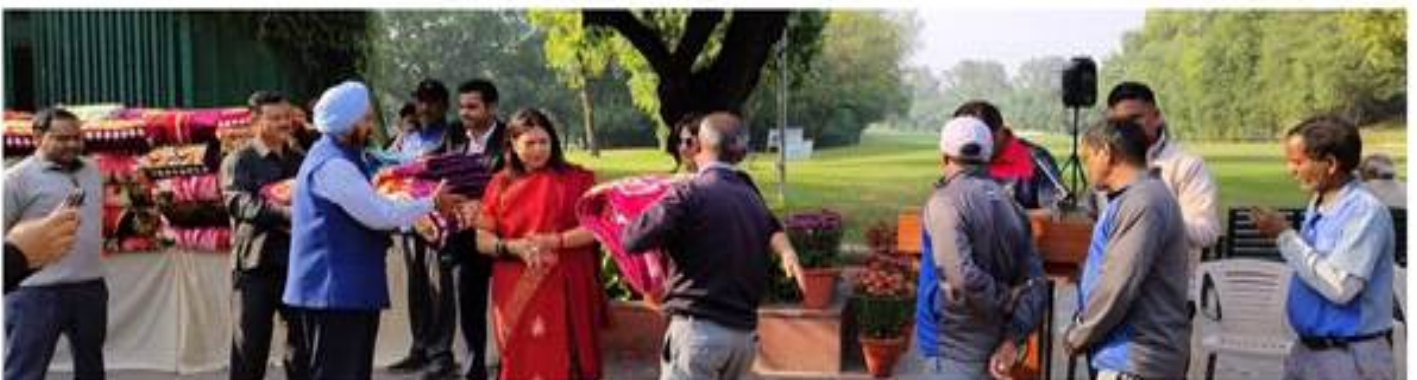
Blanket Distribution at Qutub Golf Club 5 th November 2023 & Delhi Golf Club 6 th December 2023