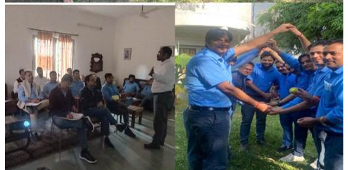
Training program on "Lean Management" & "Elevating Inter-Departmental Communication and Leadership Skills" organized at our Nalagarh Plant on 19th & 20th Oct-2023