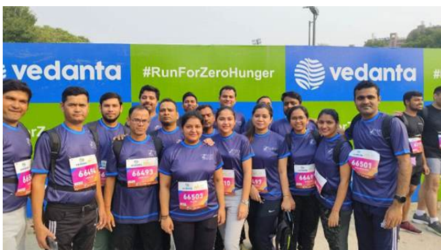
The Vedanta Delhi Half Marathon on October 15th 2023

Sara Group participated in the Vedanta Delhi Half Marathon on October 15th, 2023. The Sara Group has once again showcased not only their commitment to excellence in the workplace but also their dedication to health and well-being outside of the office. Our team members demonstrated exceptional resilience and sportsmanship and marked the continued participation of the group in this race for over a decade.