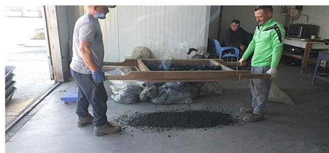
Destuffing of Cargo & Mixing of Ores in Albania