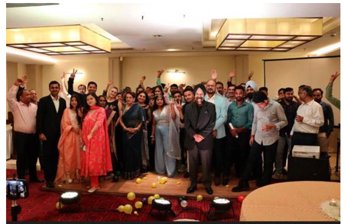
Honouring 50 Years of Excellence of Sara Group!

3rd November 2023 marks a remarkable milestone 50 years of journey – half a century of innovation, hardwork and success. We celebrated this golden anniversary and Diwali celebrations together.