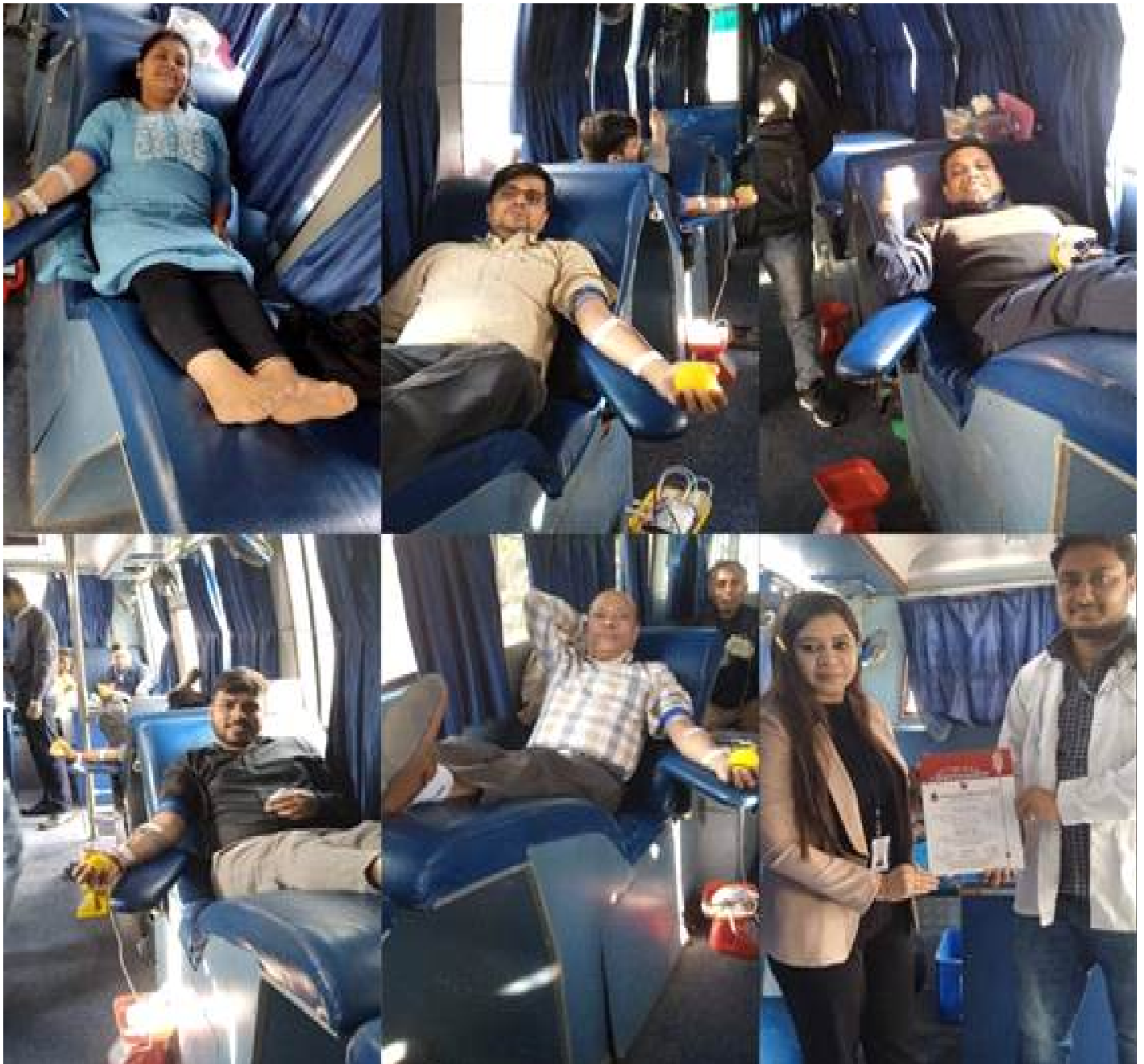
Blood Donation Camp-20th December-2023 at Sara House

In Blood Donation Camp, our incredible team came together to make a positive impact on the lives of others. Together, we are making a tangible impact on the lives of those in need.