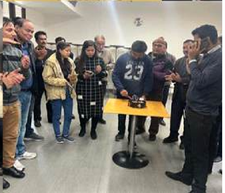
Birthday Celebrations at Sara House