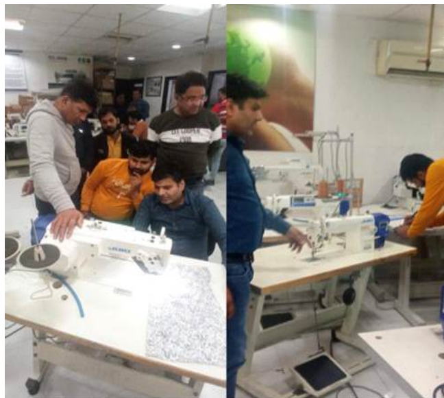
Training on Juki's Machines of MRPL Service Team at Juki's Office

MRPL Conducted a training session for Engineers on different Juki machines. It involves several key steps to ensure an effective and comprehensive learning experience.