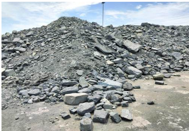
Stock of Chrome Ore ROM at warehouse ready for container stuffing and export in South Africa

This quarter has been truly encouraging and best performing quarter so far for our South African chrome business. Despite of CFR China price correction of about 15% in compared to July-September quarter, the company was still able to export about 20000.00 MTs in this quarter. Although, CFR main port China prices are down compared to last quarter, but the market sentiment is stable which is comforting for the next few months. Ferrochrome and stainless-steel production is relatively stable which is key to the Chrome business. We are gearing up to achieve much better numbers in the next quarter.