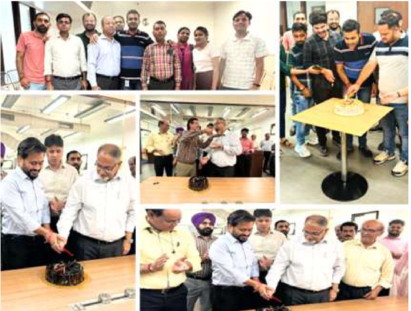
Monthly Birthday Celebration at Sara House

A workplace celebration allows employees to get to know one another better and form personal bonds. As a result, the employees are more likely to experience an increased sense of community in the workplace, which can boost morale and increased productivity.