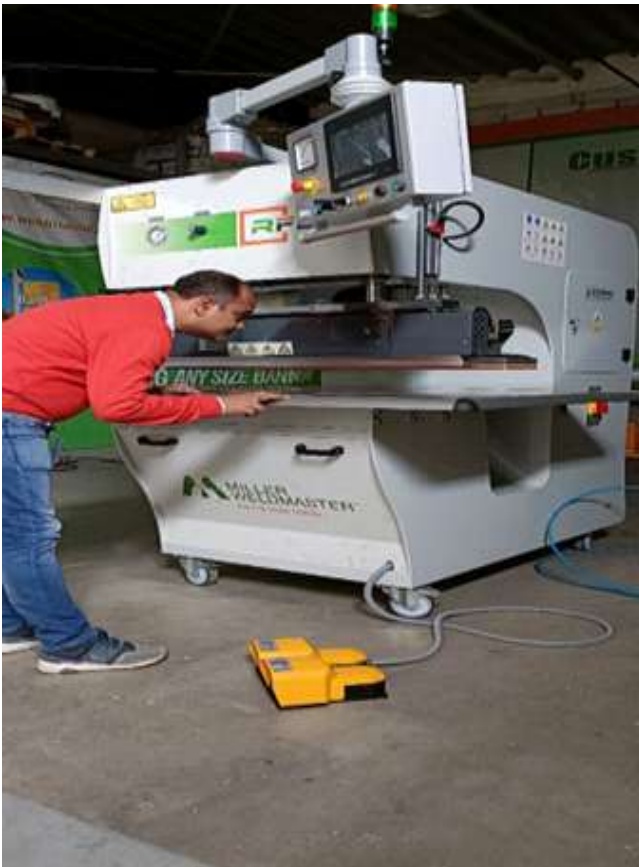
Training on Miller Weldmaster Radio Frequency Machine at Miller Netherland office

The Technical Textiles division of MRPL has been further bolstered by the extension of its long partnership with Miller Weldmaster, to now include a partnership with the Zemat Technology Group, Poland. Zemat is manufacturer of many types of industrial machines: high-frequency welding machines, machines for the production of cardboard packaging (box-makers), laser modular cutting plotters, roller die cutters, production lines and offer solutions for industry automation. A hands on technical & commercial training of 2 days was organized at Miller EU office in Nieuw-Venep, Netherlands. Addition of high frequency machines in the MRPL portfolio will complement the existing hot air & how wedge thermoplastic fabric welding technologies and open up new avenues for MRPL to expand its customer base."