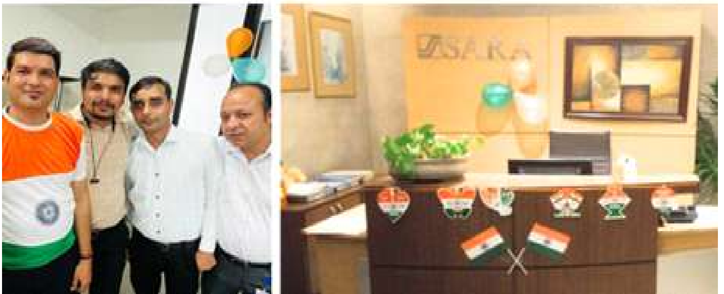
Independence Day Celebration at Sara House