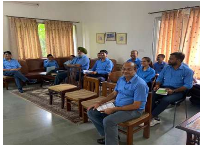
Training program on "Time Management" organized at our Nalagarh Plant.