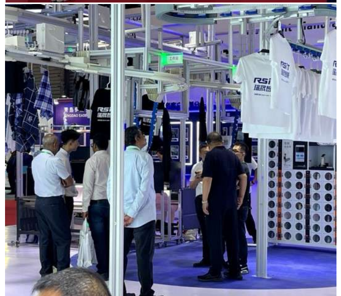
RSIT Stall at the CISMA 2023