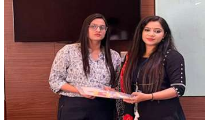
Welcoming our new Intern in HR Department

We help interns to develop additional professional skills, give career advice and clear understanding about the industries & operations.