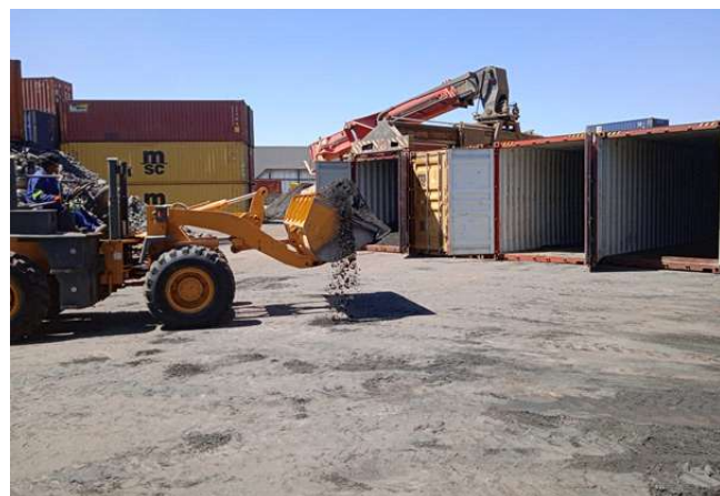
Chrome ore loading at the warehouse in South Africa

This quarter has been one of stable and strong performance for the South African chrome ore business. South African Concentrate and ROM prices were stable throughout most of this quarter delivered to China ports. Since the China Stainless steel production is stable and so ferrochrome requirements have also remained consistent. As per the latest data, Stainless steel production in September was at 3.22 million tons and the production plan in October is estimated to be around 3.17 million tons, slightly down but not in a sharp way and current chrome ore inventories at China main ports are 1.92 million tons which is down from the average level of about 2.1 million tons, which is giving a floor to the future market.