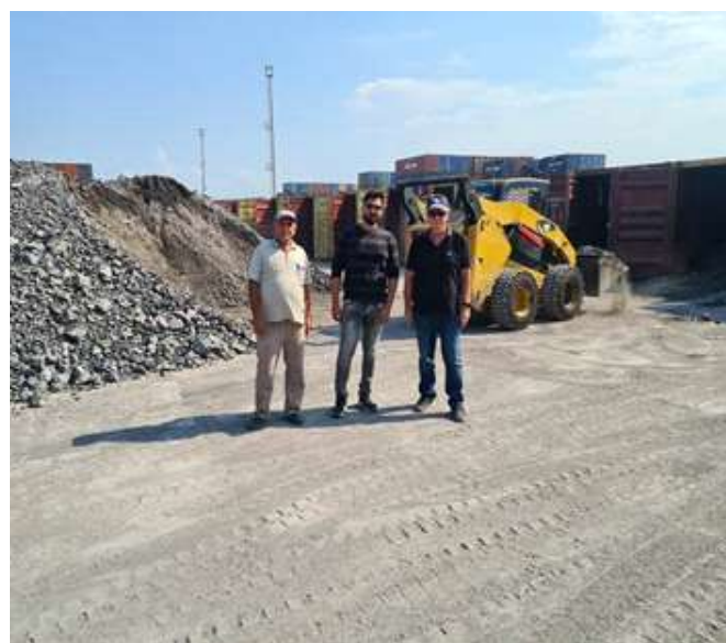
The Quality & Operation Team in Albania

The Albania supply market showed some signs of improvement in this quarter. Based on the Chinese market, prices remained relatively stable but volumes were improving. The total expected volume for exports from Albania next quarter are around 120,000 MTs. The quality control parameters in Albania seem to be robust for Sara and we are seeing positive results of the efforts being made at the load port.