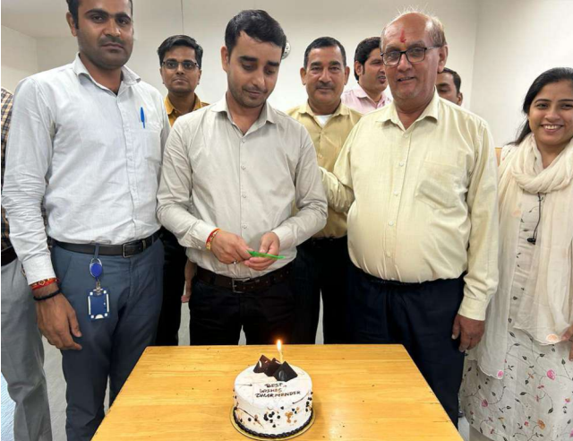
Farewell of Magnum Team member