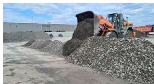
Cargo Mixing Process at the Albania load port

The Albania supply market showed some signs of improvement in this quarter. Based on the Chinese market, prices remained relatively stable but volumes were improving. The total expected volume for exports from Albania next quarter are around 120,000 MTs. The quality control parameters in Albania seem to be robust for Sara and we are seeing positive results of the efforts being made at the load port.