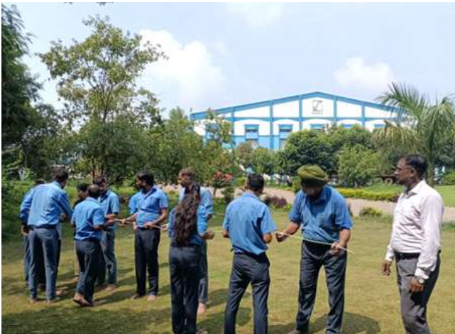
Training program on 'Team Building' organized at our Nalagarh Plant.