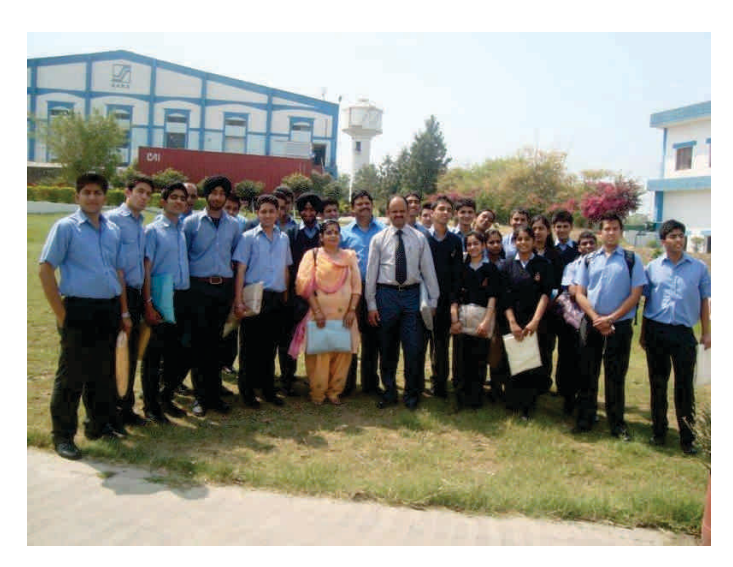
Students of Lawrence School, Sanawar, visiting the facility at Nalagarh