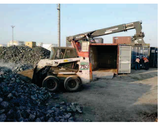
Container Stuffing of Chrome ore