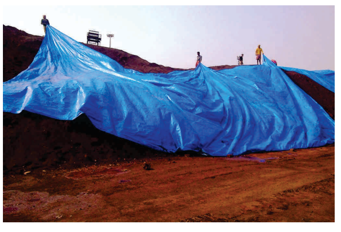
Iron ore Stock at Haldia port being covered in anticipation of the monsoons

Most large miners have had to significantly cut down product and only a handful of iron ore exporters have survived. Sara has stood firm in these turbulent times. We have shown the rigour to ride this wave of change. Our branch offices have got leaner and more agile. Orissa remains shut for operations, but we have been aggressive in procuring from the states of West Bengal, Jharkhand, Chattisgarh and Madhya Pradesh. With committed efforts of entire iron ore team, within a span of 2 months, we have been able to accumulate a shippable lot at Haldia. This momentum we believe will continue to gain pace and we will get more encouraging news.