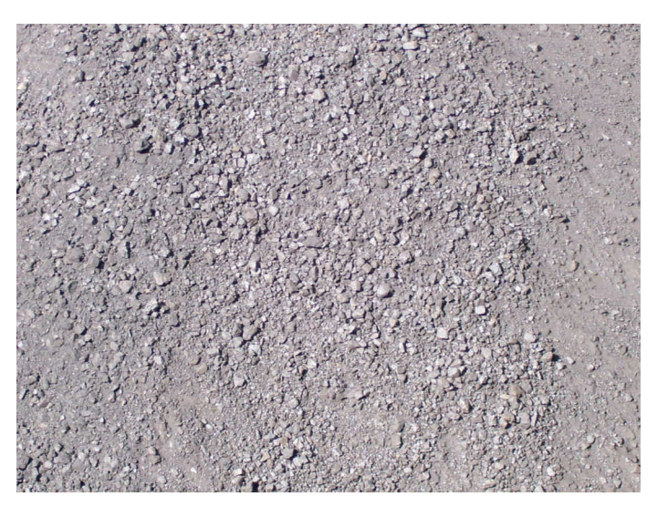
Thermal Coal from Indonesia

The India coal story has come to stand still. On the one hand, we are facing a severe shortage of power but on the other hand, regulatory issues with power projects has negatively impacted demand due to a slow down in projects. Nonetheless, demand still outstrips supply putting increasing pressure on COAL INDIA. At the time of printing of this newsletter, majority of the power plants in India are running "critically" low stocks (of less than 4 days). While the demand is there, import apetite has taken a beating due to the depreciating rupee which has wiped out any gains possible due to falling international prices. On the positive side, thermal coal imports into India are still expected to grow by over 14% to reach 90 million tonnes in the coming year but the current market scenario is one of concern and confusion.