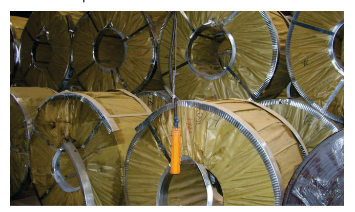
Cold Rolled Steel Coils at Chennai

During the end of the previous quarter, the government raised the import duty on steel in order to curb cheaper imports and make way for the domestic steel industry to survive. This was a sigh of relief to the Indian steel manufacturers who were already under pressure due to high input costs. However earlier in the quarter, India's National Mineral Development Corporation increased ore prices which again hit the steel industry. With such continuous increase in prices, analysts feel that India's steel manufacturing growth is likely to be a moderate 4% to 5% in the current fiscal as economic slowdown is impacting industrial projects. Various number of steel plants are already running behind schedule and have been stressed on the need for improvement.