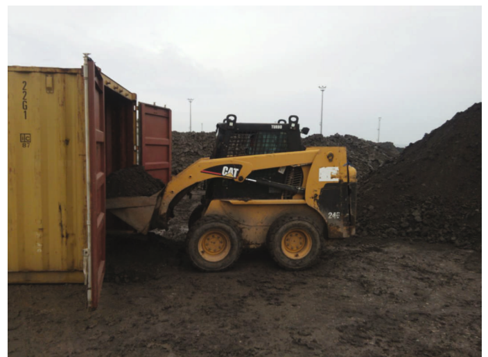
Container stuffing of chrome ore at load port

Despite a slow market in China, we still managed to ship more than 25,000 MT of chrome ore lumps to China during this quarter. Moreover, this was the first time that we had shipped a high quality material of 50/48 grade.