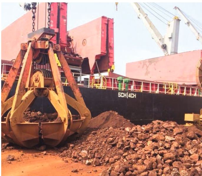
MV SUNBAY : Discharging iron ore in China

On the other hand, India has seen a huge increase in the imports of iron ore. The imports of iron ore crossed 7 million tons during the period from Apr 2014 to Nov 2014, and they are expected to touch 11 million tons by the end of Mar 2015. The major reason attributed to higher imports is drop in global prices as well as limited domestic supply. Currently prices of South African iron ore lumps is around $95/MT CIF Indian ports. Indian domestic iron ore prices, which have been rising owing to short supply, are likely to feel the pressure in the backdrop of falling global prices.