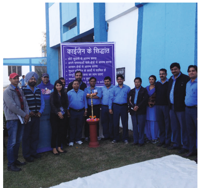
Inauguration ceremony of Project- Udaan at STL, Nalagarh

In line with its business objectives, STL is undergoing a rapid expansion of its home furnishing, made ups manufacturing capacity and this should result in markedly higher production numbers by 31st Mar 2015.