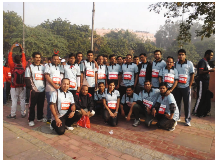
Sara Group employees participating in the "Airtel Great Delhi Run-2014"

• The ultimate measure of a man is not where he stands in moments of comfort, but where he stands at times of challenge and controversy.