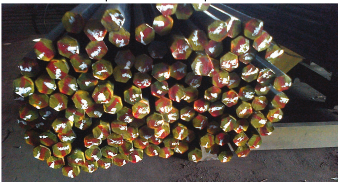
Hexagonal bars ready for shipment to South America

Steel mills in India have been under pressure this quarter due to fall in steel prices on account of weak demand, specially for rebars and structural steel. Some mills are still holding on to higher prices however, and are not able to get a share of the market. Other smaller mills are facing a liquidity crunch and competition from imported material.