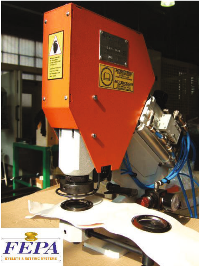
Fepa SRL machine

MRPL has strengthened its product profile by getting appointed as an exclusive distributor for Fepa SRL Italy and Daude France for sales & after sales service across their product range in India.