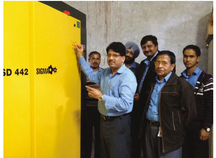
Inauguration of new machines in engineering division at STL, Nalagarh

With 2015 upon us, Sara Textiles is gearing up for its annual participation in Heimtextil with the latest collections and new products. Heimtextil is one of the world's largest textile shows held in Germany each year and STL has been a top exhibitor at the show for close to a decade.