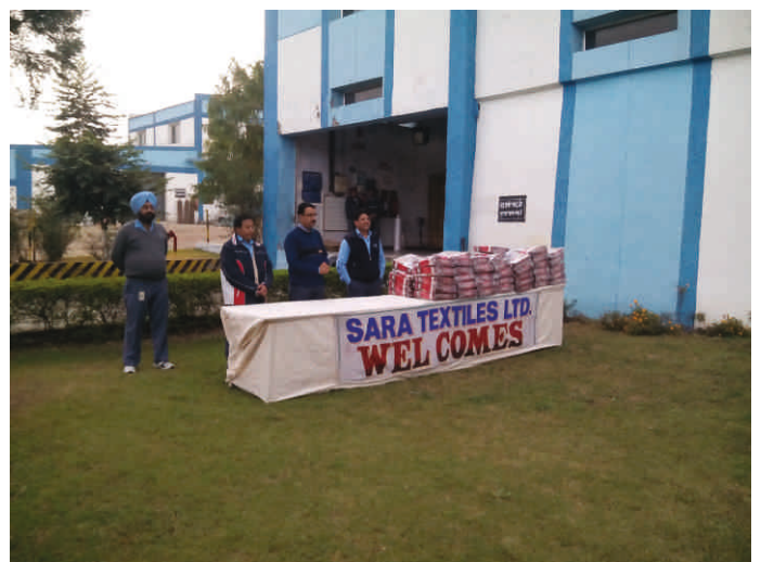
Awards function organised at the plant