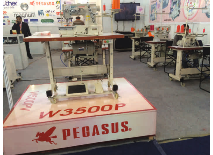
Pegasus machine display at Knit Vision 2015

Magnum Resources also participated in Knit Vision 2015 held in Ludhiana from 18th till 21st Dec 2015. Brother launched one of their most eagerly awaited machines, the Model S7300, at the show. The model's special feature includes a direct drive lock stitcher with an electronic feeding system and a thread trimming style, which attracted many customers. MRPL booked good quantities of orders for this machine in India at the show.