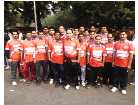
Sara employees participated in Airtel Great Delhi Run 2015

To remain indifferent to the challenges we face is indefensible. If the goal is noble, whether or not it is realized within our lifetime is largely irrelevant. What we must do therefore is to strive and persevere and never give up.