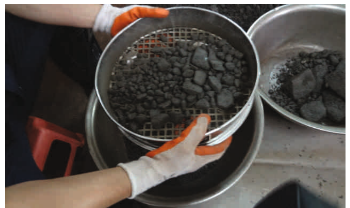
Chrome ore - Size checking in China

On the demand side, the prices have been under pressure due to the terribly slow offtake across the stainless steel and ferro chrome complex. According to most buyers in China, they do not have urgent demand for chrome ore lump, so market will remain weak for the coming few weeks.