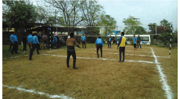
Volleyball match being organised at STL plant

STL is working exclusively on new product developments and technology advancements to attract customers and has a healthy order book going forward, with major emphasis on maintaining a very high quality level. We have been focusing on consistent quality improvements since the last few months and the same are rightly visible from the feedback we receive from our customers. Customer service has been another focus area for us and regular improvements on this crucial front is being worked on through emphasis on training, team work and engraining customer satisfaction in our culture even deeper. This has also resulted in the company organizing various employee engagement activities and events this quarter.