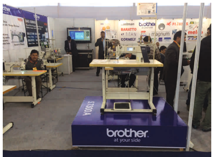
Brother machine display at Knit Vision 2015

MRPL remains on tracks to deliver annualized growth of over 25 % in FY 2015-16. However, the market conditions remain tough with private sector investment in the garments and knitting sector remaining very low. The company's strategy is to increase its market presence geographically, break into new sectors and build a more robust team and all the focus for the coming quarter is on executing the same.