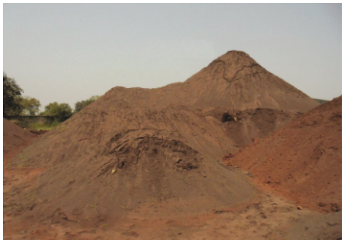
Iron ore cargo at our plot at Haldia

Due to this, Indian exporters & traders are reluctant to sell cargos at current price levels. In fact, liquidity pressures and distress have driven the only deals that have taken place in the second half of the quarter. Iron ore exports from India are expected to drop in the current fiscal from around 18 million tons in 2012-13 to around 14 million tons in 2013-14, registering a drop of over 20 percent.