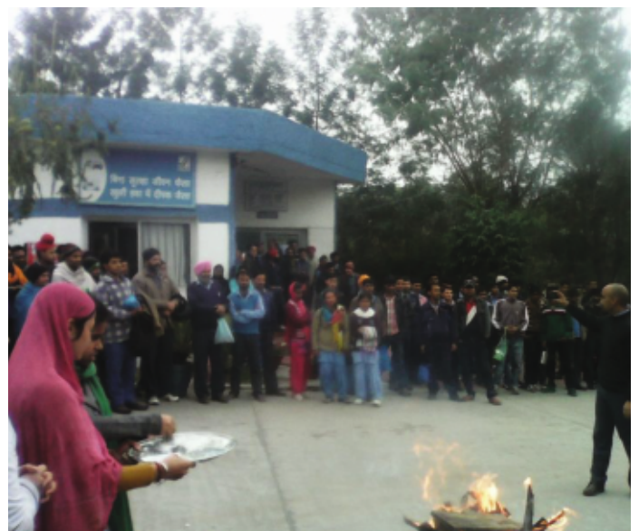
Lohri celebration at the plant, Nalagarh

In our efforts to build a congenial work environment and to further strengthen our industrial relationships with the workers and staff, a Lohri function was celebrated on 13th January '14 at the factory. There was great participation by the entire team. Such celebrations and social gatherings aim to build a sense of belonging and unity within the team.