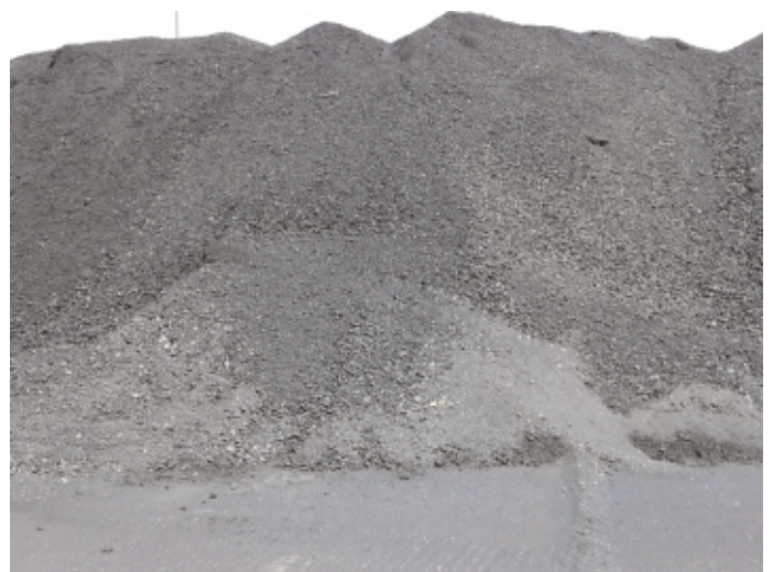
South African coal at Kandla port

During last quarter, the pollution control board in Gujarat banned the use of coal in the ceramic industries situated around the Morbi region of Gujarat. This has brought about a sudden drop in demand of Indonesian thermal coal at Kandla Port, also resulting in a rapid price fall of almost Rs. 300 per metric ton loaded onto trucks for GCV (ARB) 3600 Kcal/Kg coal. In order to curb the low demand and compete in the falling market, importers have started to bring in lower grade GCV (ARB) 3400 Kcal/Kg at cheaper prices.