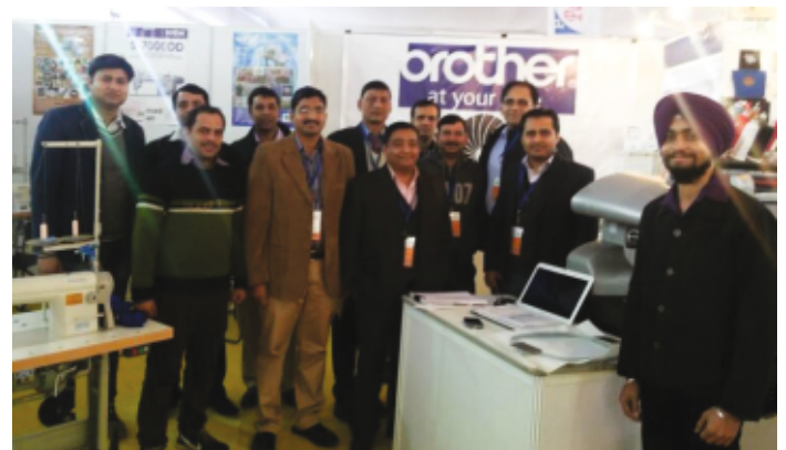
MRPL team at Knits Vision 2014, Ludhiana

MRPL also participated in “Knit Vision 2014” in Ludhiana, Punjab. The show mainly targeted the Knits customers in Ludhiana. With our latest range of high productive machines for Knits production, the show drew a great response with many customers showing interest to add the latest technology to their existing production capacity.