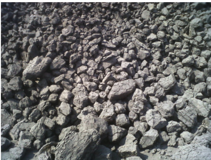
Indonesian coal at Kandla port

Due to limited supply of Columbian coal, the demand for South African has been picking up in the European region. Due to this, the spot prices have been very uncertain, ranging from as high as USD 84/MT FOB levels, to low as low as USD 75/MT FOB levels, a fluctuation of more than 10% in one quarter.