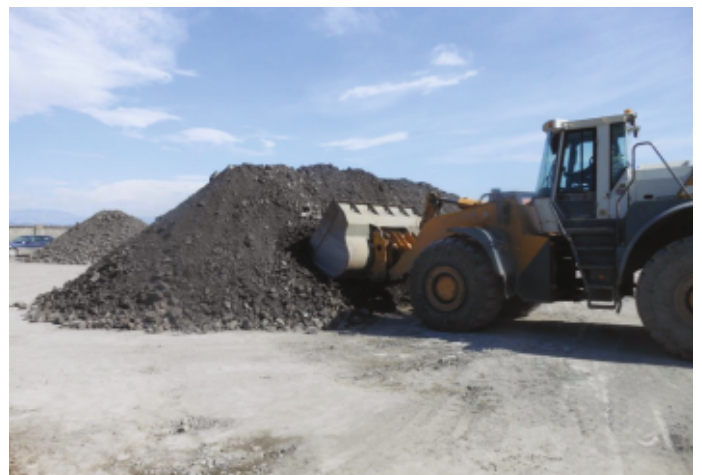
Chrome ore stock ready for container stuffing

This quarter has seen an increase in the supply of chrome ore from Turkey & Iran to China. Other countries like South Africa, Pakistan, and Oman have also shipped substantial quantities to China. This has put a ceiling on the price rise for chrome ore and is likely to remain a longer-term scenario.