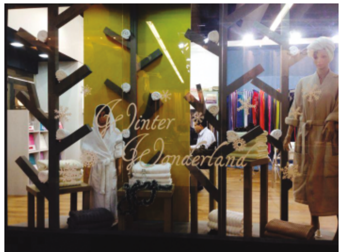
Sara Textiles Ltd. at Heimtextil 2014, Frankfurt

It is better to have enough ideas for some of them to be wrong, than to be always right by having no ideas at all.