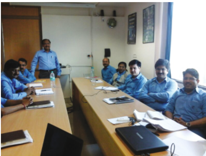
MDP session at factory

With our increasing focus on learning and development, we continued our investment in management development programs. Various sessions such as Stress Management & Life Challenges; Problem Solving and Decision Making, Team Building, Achieving targets, Positive Attitude were conducted by our external trainer & coach. These sessions were attended by all the department heads.