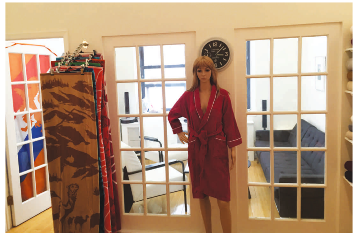
STL showroom in USA

Always bear in mind that your own resolution to succeed is more important than any one thing.