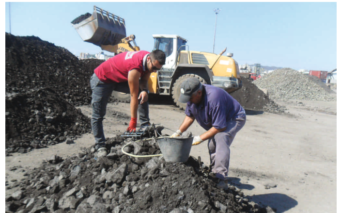
Sampling of chrome ore at the load port

The sudden depreciation of the Chinese currency badly hit the imports of chrome ore. Due to the weakening of the currency and subsequent increase in the landed costs of imports, there is increasing pressure on the ferro alloy industry to cut production. Buyers have reduced their buying prices for chrome ore of all origins including Turkey, Pakistan, Albania, Oman and South Africa. In fact, the prices of Albanian chrome ore 42/40 grade fell from USD 215/MT CFR China to US$ 200/MT CFR China within a span of two months. This fall in prices have been off set by the depreciating currencies in Turkey and South Africa, which have been able to maintain their volumes by reducing prices.