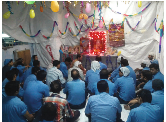
Vishwakarma Puja at plant

A Pooja was organized within the factory premises on the auspicious occasion of Vishwakarma Pooja on 17th Sep'15. The team members prayed for safe and healthy working condition.