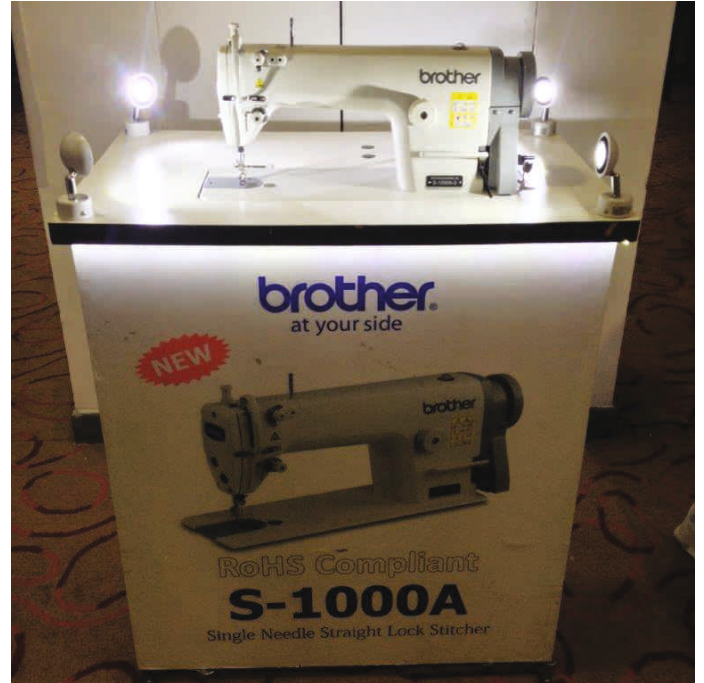
Brother's latest machine at display

In the coming quarter, a team from Magnum will be visiting the ITMA Milan which is going to be held in November. This will help in adding more principals and products in our basket.