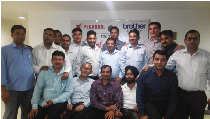
MRPL Dealers meet in Ludhiana

MRPL organized a dealers meet in Ludhiana in the month of August. Dealers across various locations from Punjab attended the meet. They were enthusiastic to be part of the event as new machines of Brother and Pegasus were showcased. They appreciated the way Magnum was handling the promotion of these new machines in the market. With the latest technology advancements of Brother and Pegasus, Magnum has taken great initiatives to launch new promotional schemes for its dealers. Looking at the positive response in Punjab, MRPL is planning to do more dealer meetings in other states as well.