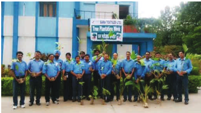
Plantation week at Nalagarh factory

In continuation to our green initiatives, 'Plantation Week' was organized between 16th Jul'15 to 23rd Jul'15. The objective was to take active part in the great cause to save the environment.